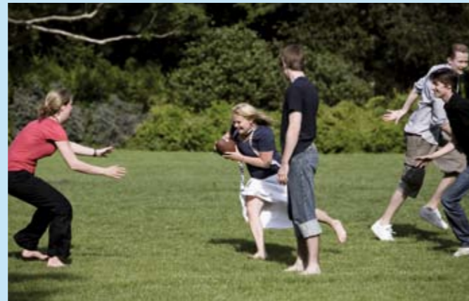
A game of rugby in the park after a picnic organized by ESN-Groningen

Many faculties and degree programmes organize their own introduction for international students. During these activities you can get to know each other, staff, and receive further information about courses, procedures, schedules and facilities.