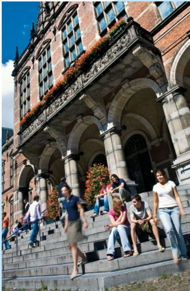
The Academiegebouw, the heart of the University of Groningen

Founded in 1614 the University of Groningen is one of the oldest universities in the Netherlands and enjoys an international reputation as one of the leading research universities. It is a university with a modern, student-oriented vision on education.