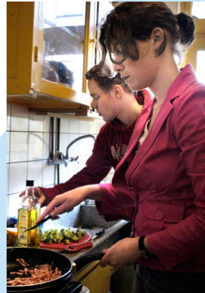
Students preparing their meal

The Netherlands is one of the smallest countries in Europe and one of the most densely populated countries in the world. Foreign visitors are often surprised to learn how difficult and expensive the housing situation is. The University of Groningen, like many other Dutch universities, does not have a campus, which means that every year, thousands of new first-year students scramble to find small rooms or apartments.