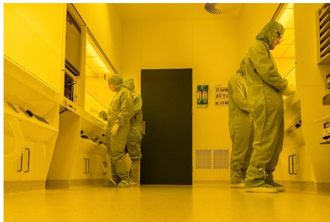
Top master Nanoscience Students inside cleanroom of NanoLab NL in Groningen.