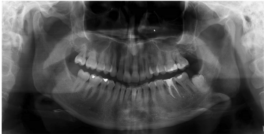
Fig. 1 Pre-operative panoramic radiograph of a failing molar in position 36

implant placement, a follow-up visit was scheduled for suture removal and to review the healing process. After 3 months, the implant was uncovered and a healing abutment (NobelBiocare AB) was installed.