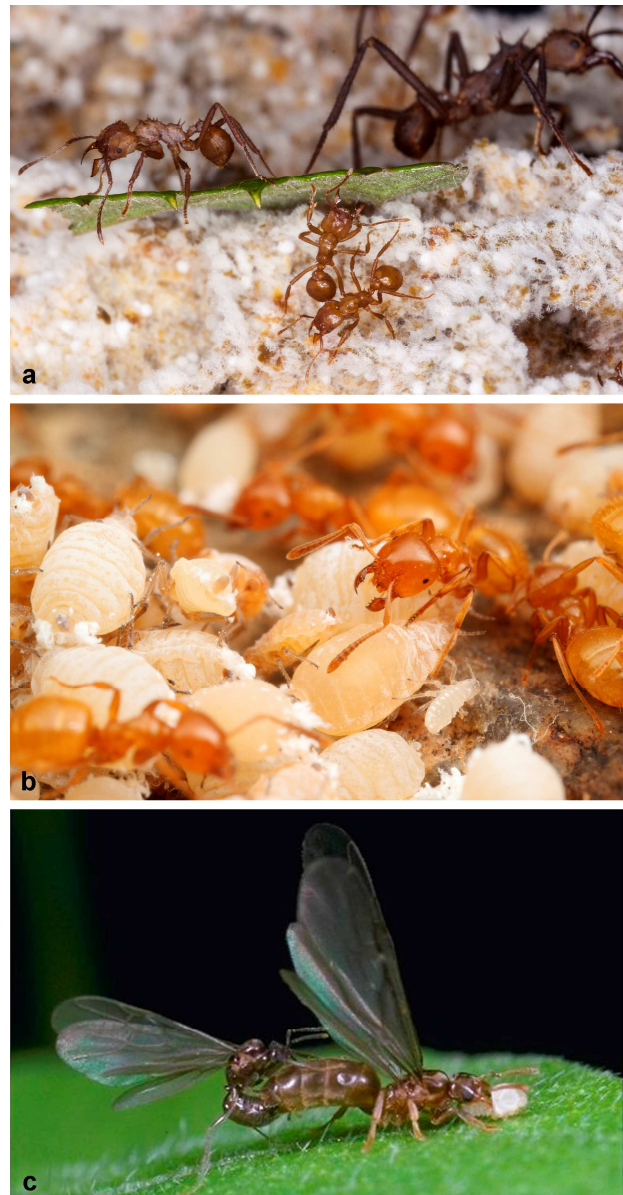
Fig. 2: Three examples of ant farming of fungi (a), root aphids (b) and mealybugs (c) for food. (a) Acromyrmex leaf-cutter ants tending their fungus garden; (b) subterranean Lasius ants tending Prociphilus aphids; (c) an Acropyga queen and male mating while the queen is holding an adult female Eumyrmococcus mealybug in her mandibles, an example of trophophoresy.

Fungus-growing behaviour in attine ants evolved approximately 50 million years ago (SCHULTZ & BRADY 2008, MIKHEYEV & al. 2010). All fungi cultivated by attine ants are basidiomycete fungi belonging to the tribe Leucocoprineae (MUELLER & al. 1998, VO & al. 2009, MEHDIABADI & SCHULTZ 2010, MEHDIABADI & al. 2012). Cophylogenies between the attine ants and their fungi show a history of close co-evolution, with major evolutionary transitions to coral farming, yeast farming and fungal farming on cut leaves being well-represented; these major tran-