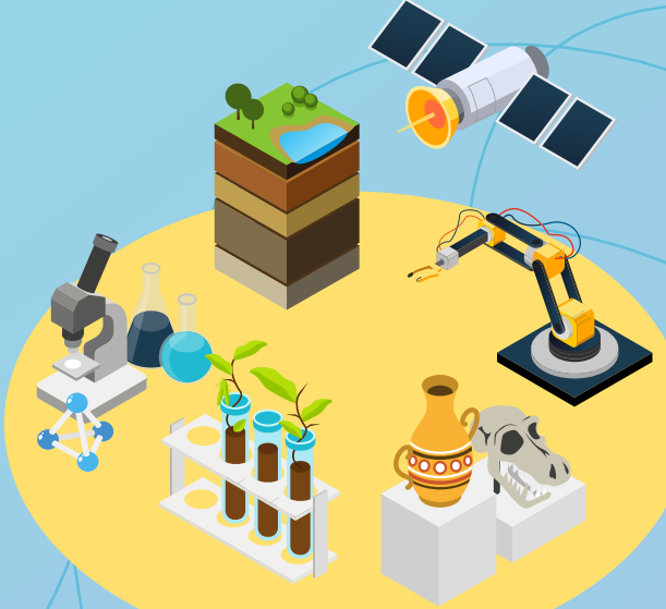
Publications in ALL SUBJECT AREAS funded by Horizon 2020 and Horizon Europe