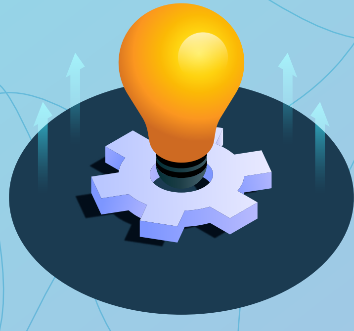
Submission of ORIGINAL ARTICLES stemming from projects