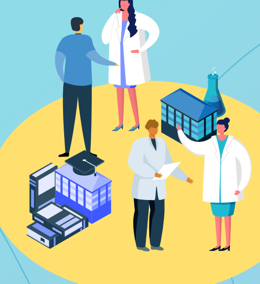
Authors involved in HORIZON 2020 and HORIZON EUROPE projects