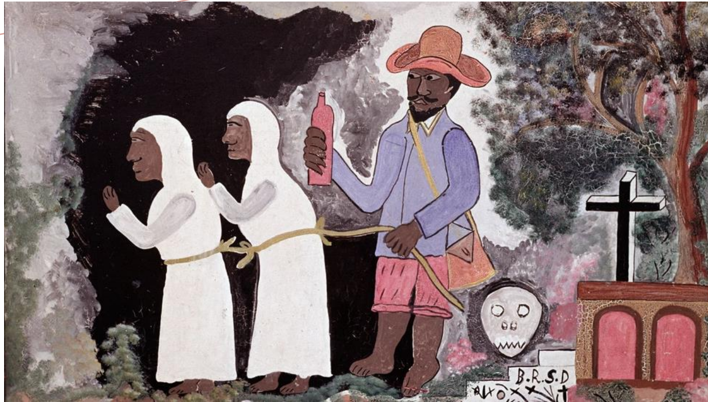
"The Zombies" by Hector Hyppolite