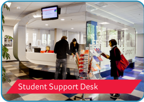
Student Support Desk