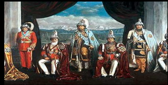
Rana Dynasty 1885-1951