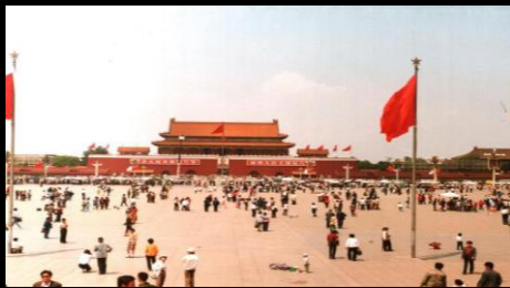
Tiananmen Square, China - Student protest, 1989