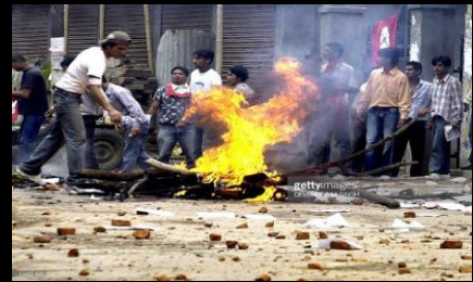
Student demonstration in front of the TU campus, 2008