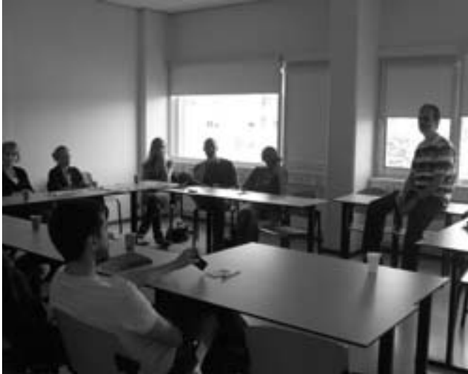
Developing a talent for science